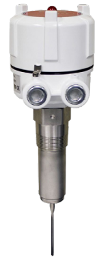
Vibrating rods (also known as vibrating level switch) are reliable point level sensor for high and low-level indication or plugged chute detection.

A tilt switch is a high-level indicator designed to install easily and require no routine maintenance. The switch is activated when material rises and tilts the switching mechanism 15°. A fixed-mount tilt switch mounts from the outside on the top of the bin through a process connection. It is custom-made to a specific length determined by the distance from the top of the bin an alert should be activated. Alternatively, a hanging tilt switch is installed by suspending it from a flexible cable within the bin or over a pile of material. A hanging tilt switch also can be used for plugged chute detection. A note of caution: some tilt switches are made using mercury, so be sure to select a mercury-free model if one is required for compliance with environmental regulations.