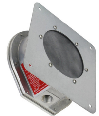
Diaphragm switch activates when material rests against the sensitive micro-switch and is used to start or stop a process or alert to high, medium or low material levels.