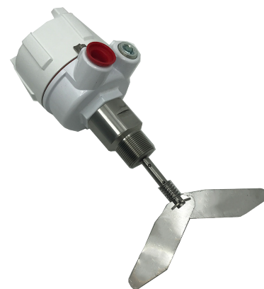
Rotary for point level indication of high, mid and low levels of material in bins, tanks, and silos. Come with a wide variety of paddles and mounting plates.

Capacitance sensors are designed for an array of applications and can be customized with different types of probes, lengths, or extensions. There are thousands of configurations for hazardous locations, sanitary applications, flexible hanging probes, flush mounting, remote electronics, auto calibration, heavy duty, compact, and bendable probes. These sensors may be used for high-, mid-, and low-level detection in bins, silos, tanks, hoppers, chutes, and other types of vessels in which grains, pellets, or powders are stored, processed, flowing, or discharged.