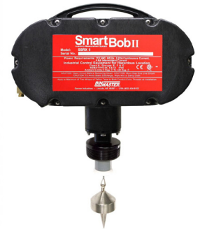
SmartBob for powder and bulk solids in bins, tanks, and silos.

A guided wave radar is a sensor that suspends a cable down into the bin to measure liquids, powders, and bulk solids with a dielectric constant greater than 1.3 in vessels up to 100' tall. It utilizes time domain reflectometry (TDR) to measure the distance, level, and volume of material. The sensor is immune to dust, humidity, temperature, pressure, and bulk density changes as well as noise present when filling or emptying the vessel. In the grain and milling industry, guided wave is used for smaller vessels containing ingredients or additives. It is a complement to other types of continuous level sensors in a network.