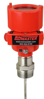
Guided wave radar measures distance, level, volume in bins, tanks and silos. Immune to dust, humidity, temperature, noise and pressure.