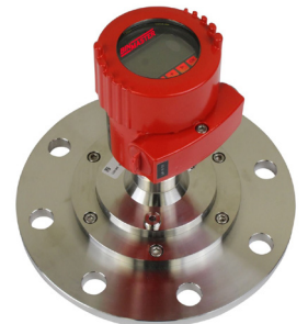
Non-Contact radar for solids. 80GHz continuous level measurement good for extremely dusty powders and bulks solids.