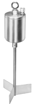
Tilt switch (model BM-T) detects high levels of heavy materials in silos and bins. Good as load sensor over open piles or conveyors