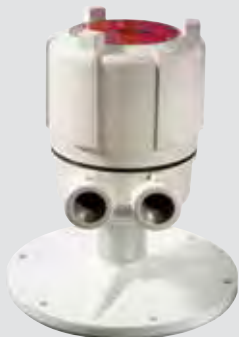
PROCAP I & II FL