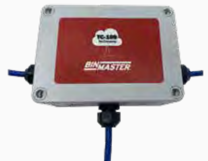
TC-100 Tee Connector

The TC-100 Tee Connector makes it easy to connect three cables together. It reduces the amount of equipment and components needed to make electrical connections. The TC-100 is an economical and convenient junction box that saves time and money.