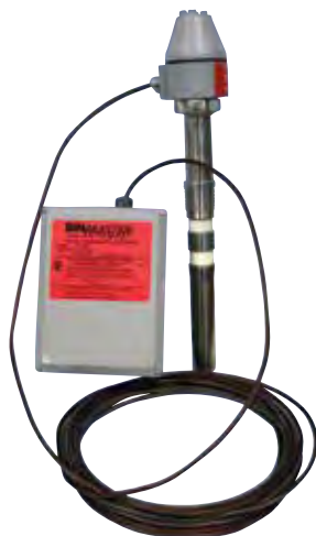
PRO HTRC-20 Remote Capacitance Probe

Process Temperature: Up to 1112°F (600°C)