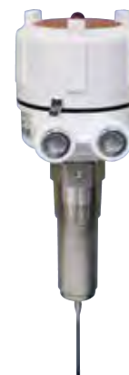
VR-21 Standard Vibrating Rod

Time Delay: 1 second from stop of vibration, 2 to 5 seconds for start of vibration