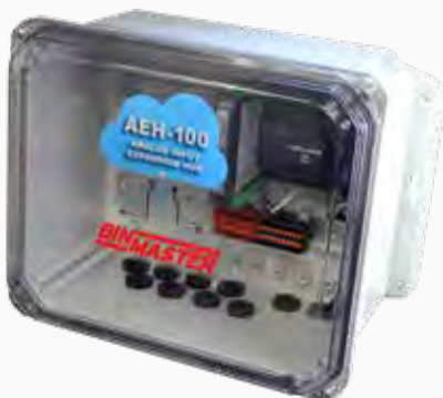
AEH-100 Analog Expansion Hub

The AEH-100 analog expansion hub simplifies setting up a sensor network or upgrading an existing sensor system to a cloud-based network. The AEH-100 connects analog sensors to the BinCloud® Gateway to access data from BinCloud software.