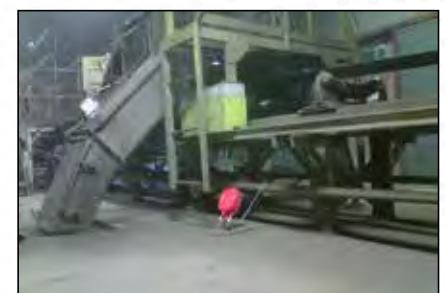
Construction Materials Silos containing roofing granules and gypsum for making drywall.