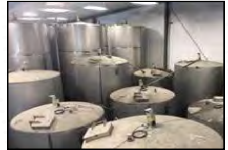
Chemical Processing Materials used in the making of paints, fertilizers, or detergents.