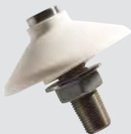
Airbrator Aeration & Vibration