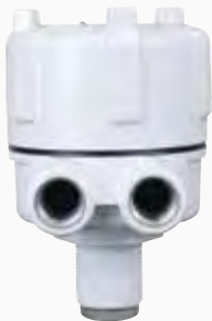
FD-2000 Flow/No Flow Detector

These non-intrusive, flush-mounted devices are used in gravity chutes, feeders, pipelines, or conveyor belts to detect flow or no flow conditions using Doppler technology. They are used for batch process control or as a preventive control in FSMA, USDA, and FDA compliance.