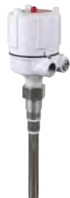
PROCAP I & II HD