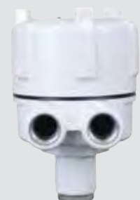
FD-2000 Flow/No Flow Detector