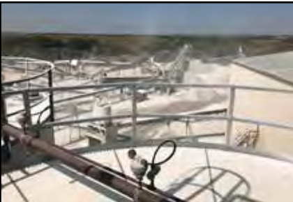
Mining & Metals Fine powders such as bauxite, bentonite, alumina, potash, talc, or calcium carbonate.