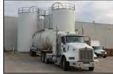
Plastics Manufacturing Resins of all types including pellets, flakes, and powders, or powders