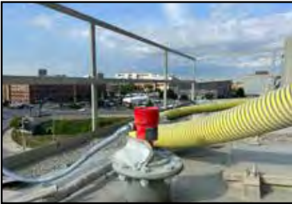
Grain, Seed, & Feed Corn, soybeans, wheat, rice, or milo used in human and animal food production.