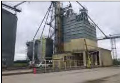
Food, Beverage Processing Non-contact measurement of ingredients like flour, salt, sugar, or cocoa.