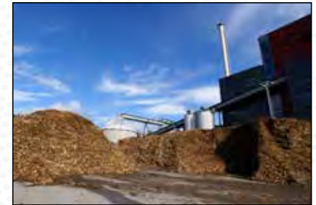
Pulp, Paper & Wood Pellets, biomass, wood chips, or sawdust used in making paper, furniture, or biofuels.