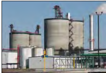
Ethanol & Bioenergy Accurate volume for corn storage and measuring dried distiller's grains.