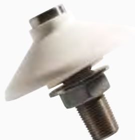
Airbrator Aeration & Vibration

Keep solids and powders flowing and prevent material from packing up in hoppers, along bin walls, or in the cone of the vessel. Preventing compaction helps promote material flow to ensure consistent batching while keeping process operations running smoothly.