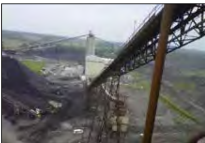
Coal Power Plants A popular sensor for measuring coal and fly ash silos at power plants.