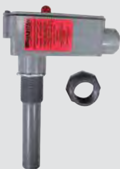
Compact PRO Mini Capacitance Probe

LED: Indicates material presence or absence