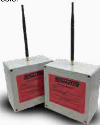
WL-19 Wireless Transceivers

Simplify installation and reduce wiring costs. A point-to-point configuration eliminates running wire from the control source to the first sensor in a single group of vessels. A multi-point solution eliminates running wire from the control source to the first level sensor in multiple groups of vessels.