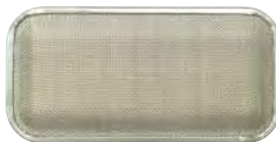
Air Pads Flow Enhancer