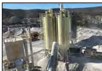
Sand & Aggregates Glass manufacturing and measuring sand and rock, excelling in frac or silica sand.