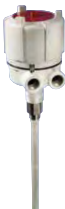
PROCAP I & II