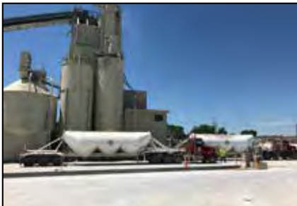
Cement & Concrete Measuring limestone, aggregates, clinker, and finished cement.